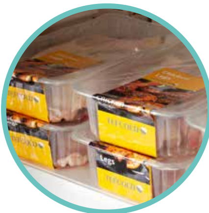
Suitable For Fresh Meat