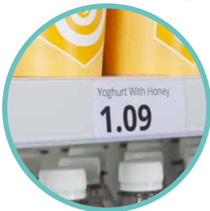
EPOS Ticket Strips