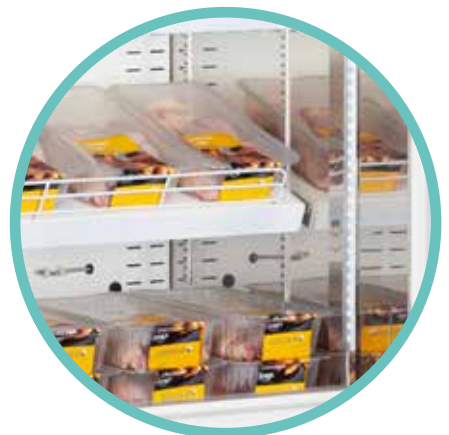
Shelves Can Be Angled Between 2° & 20° (Shelf Risers Are An Optional Extra)